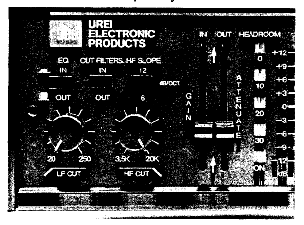
Active and passive filter bypass, switchable and continuously variable LF and HF rolloffs with selectable slopes, and a unique headroom control circuit.

Continuously variable filters at each end of the frequency spectrum control the available bandwidth of the system with a 12 dB per octave slope. The high frequency slope is switchable to 6 dB per octave to aid in contouring, and a bypass switch removes them from the circuit completely.